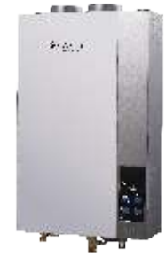
POWER GAS 16L ETL

Toll Free: 1-855-627-3955 1-855-MAREY-55